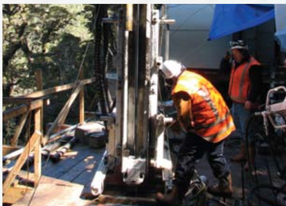
New borehole being drilled

The impacts of a higher than expected New Zealand dollar are being buffered by higher coal prices. Typically, higher New Zealand and Australian exchange rates relative to the US dollar translate to higher international coal prices as the Australian coal producers dominate the supply of product.