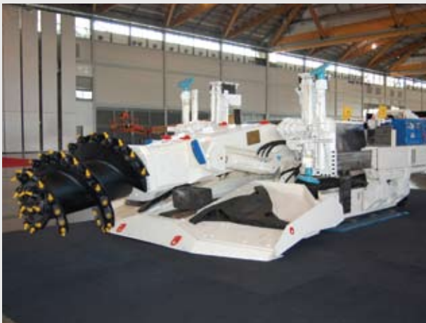
Roadheader mining machine

The roadheader is undergoing final checks and pre-delivery reviews by Pike River management in Newcastle, NSW, prior to dispatch by ship to the mine site. The other two mining machines, the continuous miners, are en route from Germany to Newcastle at present and are expected to be delivered to the mine in January 2008.