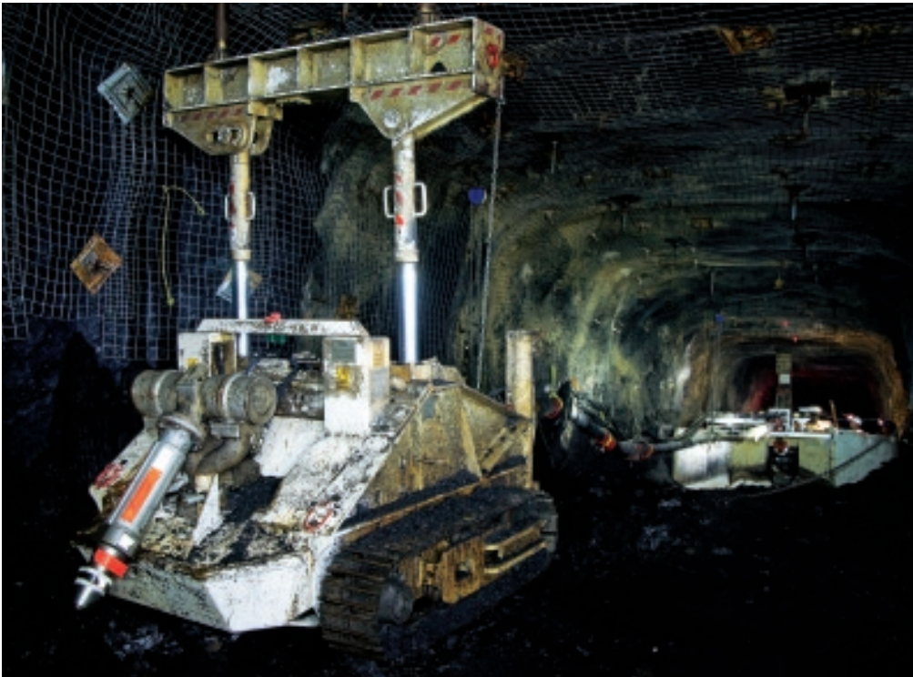
Hydro Monitor with "Guzzler" (in background)

This past quarter has seen the achievement of a significant milestone for Pike River: the successful start to our hydro-mining operations. Commissioning started on 20 September 2010 with no significant system or component failures. The hydro-mining system has synchronized together very well and all components of the hydro-mining system are now in place. The hydro monitor cut its first 1,000 tonnes of coal and delivered this product to the coal preparation plant at the end of September. A number of commissioning tasks are being addressed by the project team to bring the current system to full capability. It is important to note that our previous and current mine and production schedules have allowed for this ramp-up of hydro-mining to full capacity.