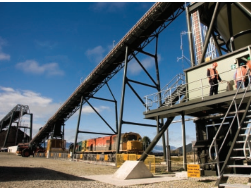
Second shipment of coal being loaded at Ikamatua rail loadout facility

Pike River's second export shipment comprising 22,000 tonnes of premium hard coking coal was dispatched to Indian customer Gujarat NRE on 6 September 2010. Worth approximately NZ$6 million, the shipment was sold at a slight discount to premium due to higher ash levels. The departure date of the consignment coincided with the 7.1