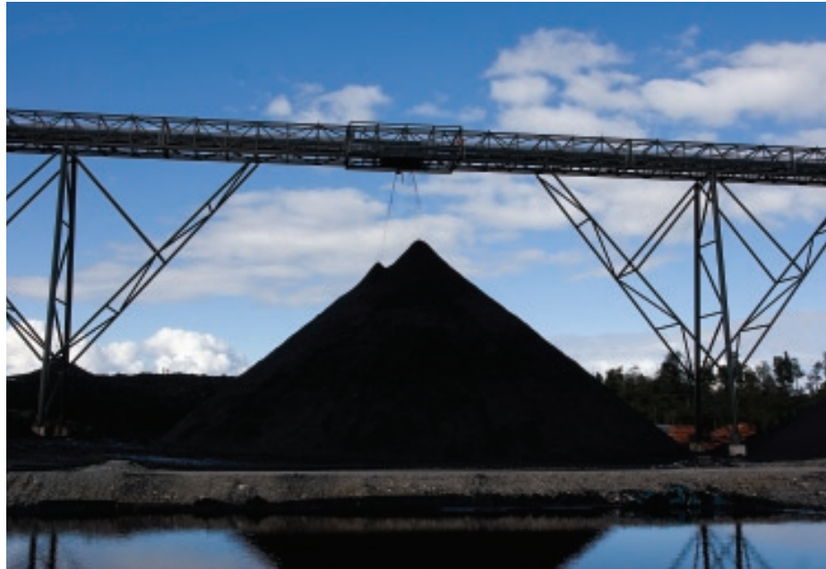
Coal stock pile at Coal Preparation Plant ready for export shipment

Pike River is continuing to build its stockpiles for future shipments. The company has contracts in place for our premium coal specification product for the life of mine. However, during hydro-mining commissioning and ramp-up of production, a better overall yield and, therefore, more saleable product is achieved through the coal preparation plant by running at a slightly higher ash content than the 1% premium target. Pike River is therefore looking to place the next shipment at this higher ash level and is finalising details for the next shipment later in 2010.