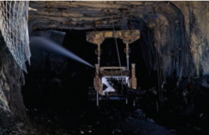
Hydro-mining in action

the company has reviewed its current mine schedule and mine plan. The main parameters that impact on the reforecast are: